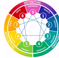
Hyde Park Community UMC Enneagram Type Discovery August 23-24 Click here for more details