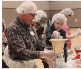
Gem City Church Collective Meal Packing Serve Event August 16 Click here for more details