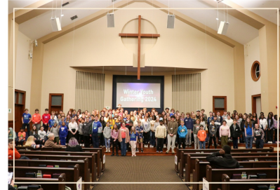
EVENINGS FILLED WITH FUN, FOOD, WORSHIP & CONNECTING WITH OTHERS!

Please help us spread the word and encourage youth from your churches to register for this impactful gathering. We look forward to welcoming young people from all over the conference as they come together for a night of faith and fellowship.